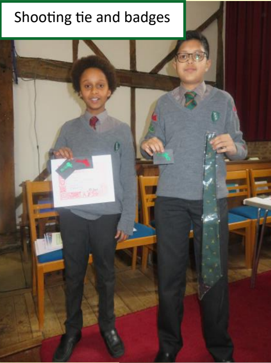
Shooting tie and badges

Some prizes given out at our latest Assembly