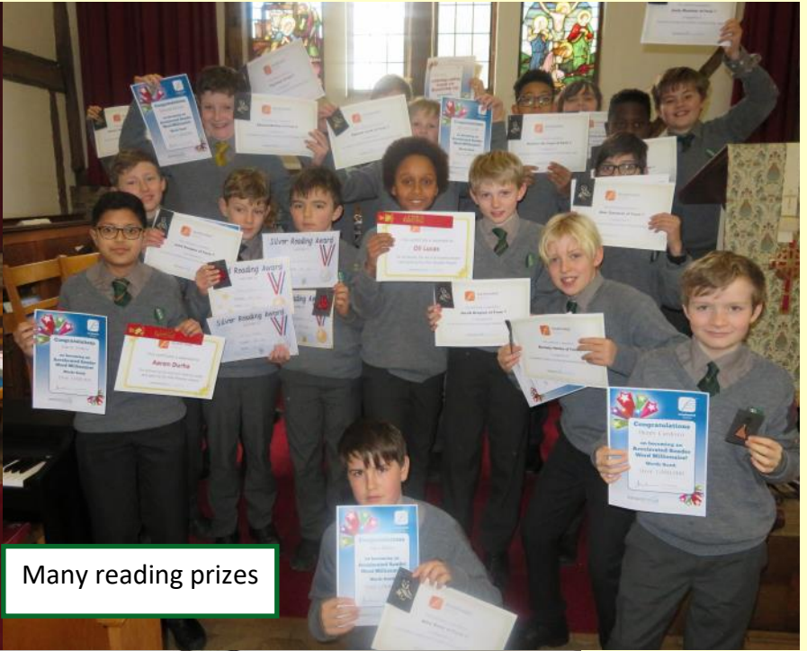
Many reading prizes