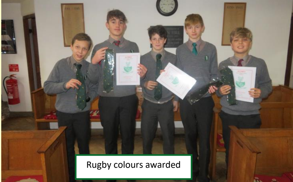
Rugby colours awarded

Well done to the U9 and U8 chess teams who played well on Wednesday afternoon gaining valuable experience. Holy Trinity School, Guildford enjoyed their matches against the Aldro boys and all the teams enjoyed a generous match tea.