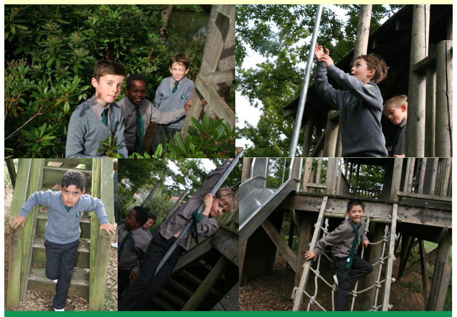
Form 3 First Matches!

It has been lovely to see all the Form 3 boys adapt so quickly to their new life at Aldro. They have all settled well in to the Junior Department and are enjoying all the opportunities Aldro has to offer.